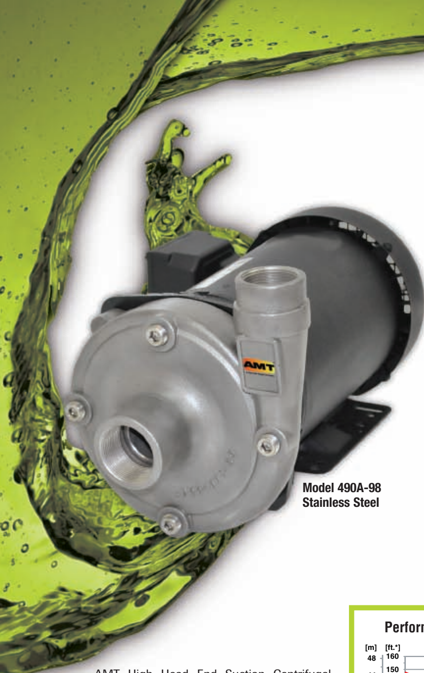
Model 490A-98 Stainless Steel

AMT High Head End Suction Centrifugal pumps are designed for continuous-duty OEM, Industrial/Commercial and processing applications including circulation, chemical processing, liquid transfer, heating and cooling, sprinkler/fire protection systems and pressure boosting.