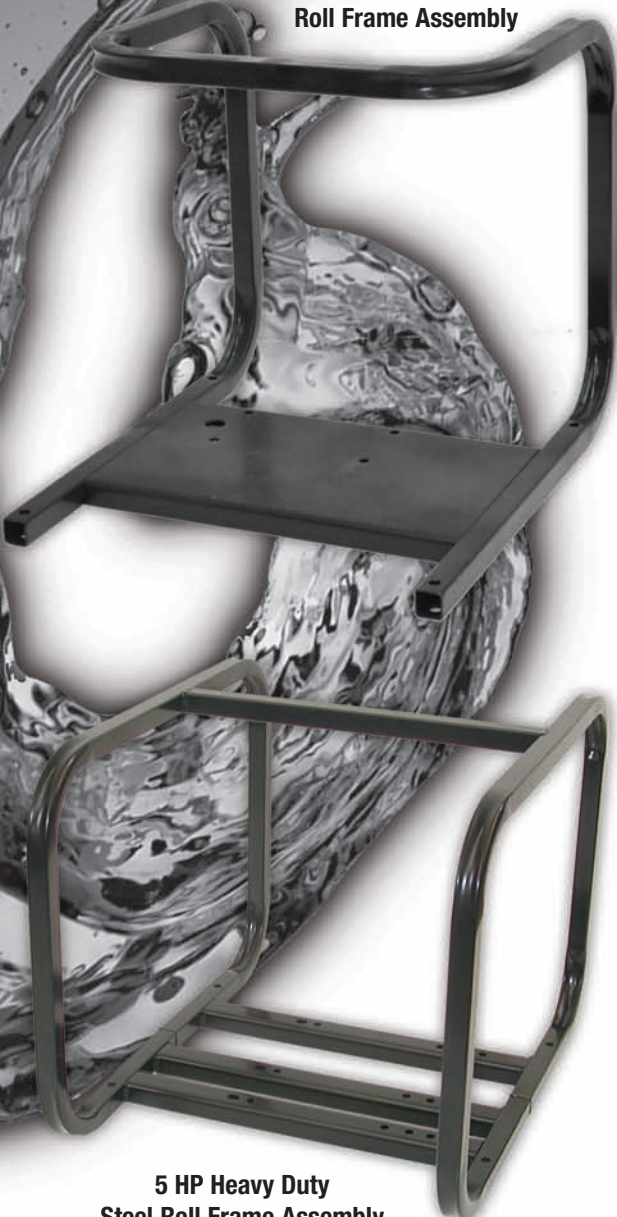
5 HP Heavy Duty Steel Roll Frame Assembly