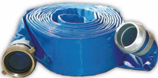
PVC Flexible Discharge Hose